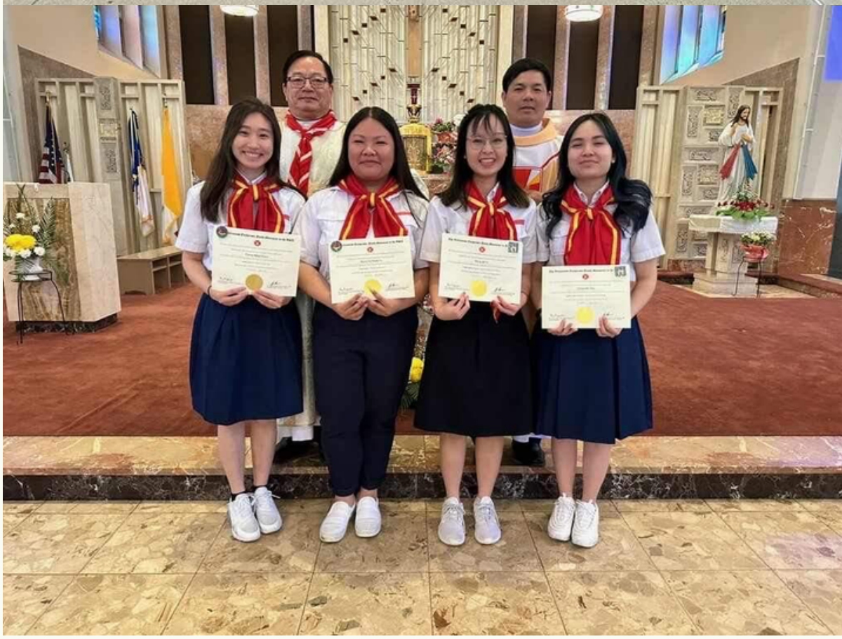
BCH Đoàn Saviô Nhiệm Kỳ 2023 - 2025 and newly promoted Huynh Trưởng Cấp I & II