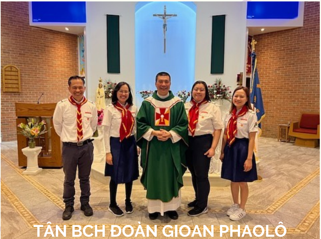
TÂN BCH ĐOÀN GIOAN PHAOLÔ